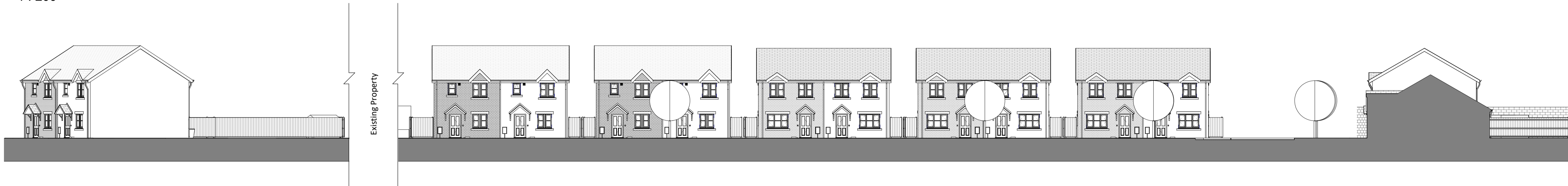
Street Elevation 02