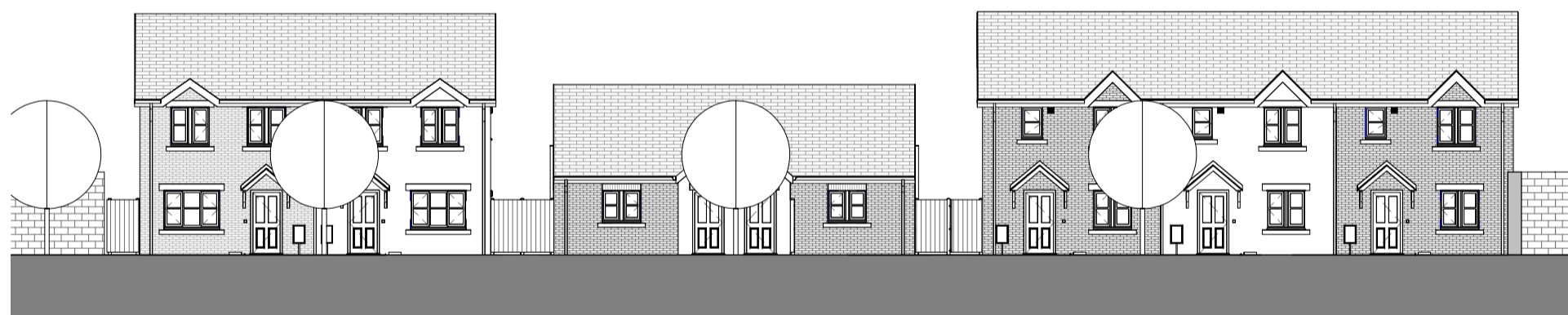
Street Elevation 04