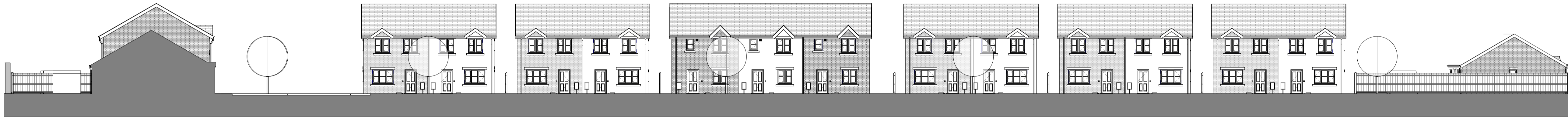
Street Elevation 03