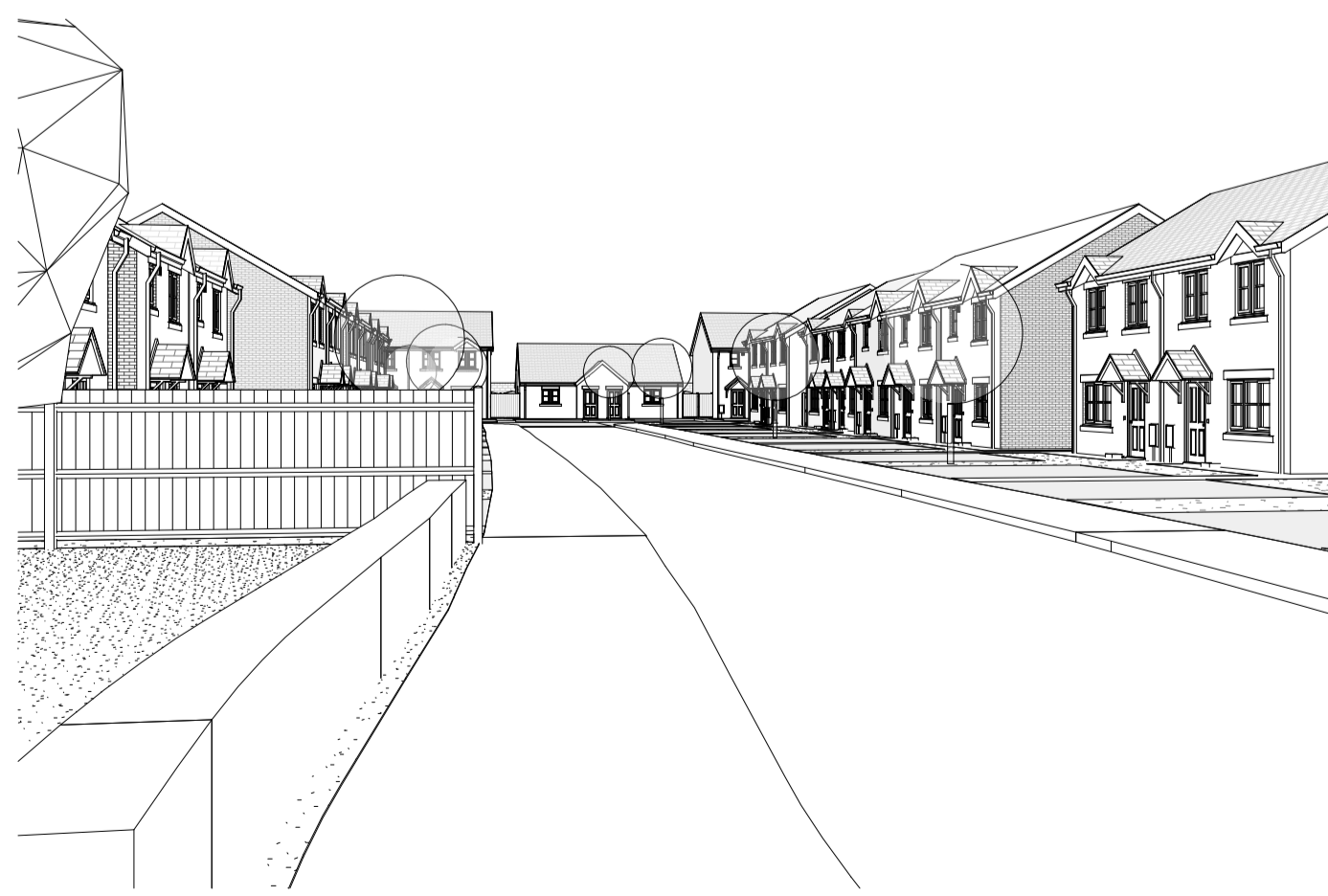
3D View B