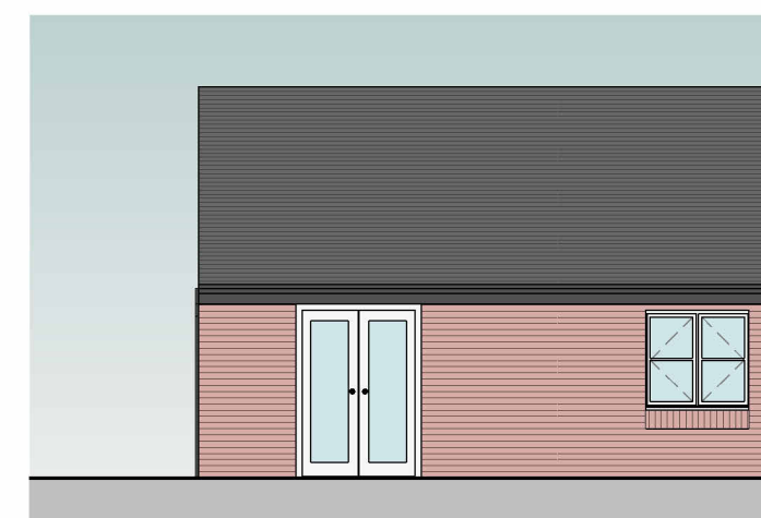
REAR SCALE: 1:100