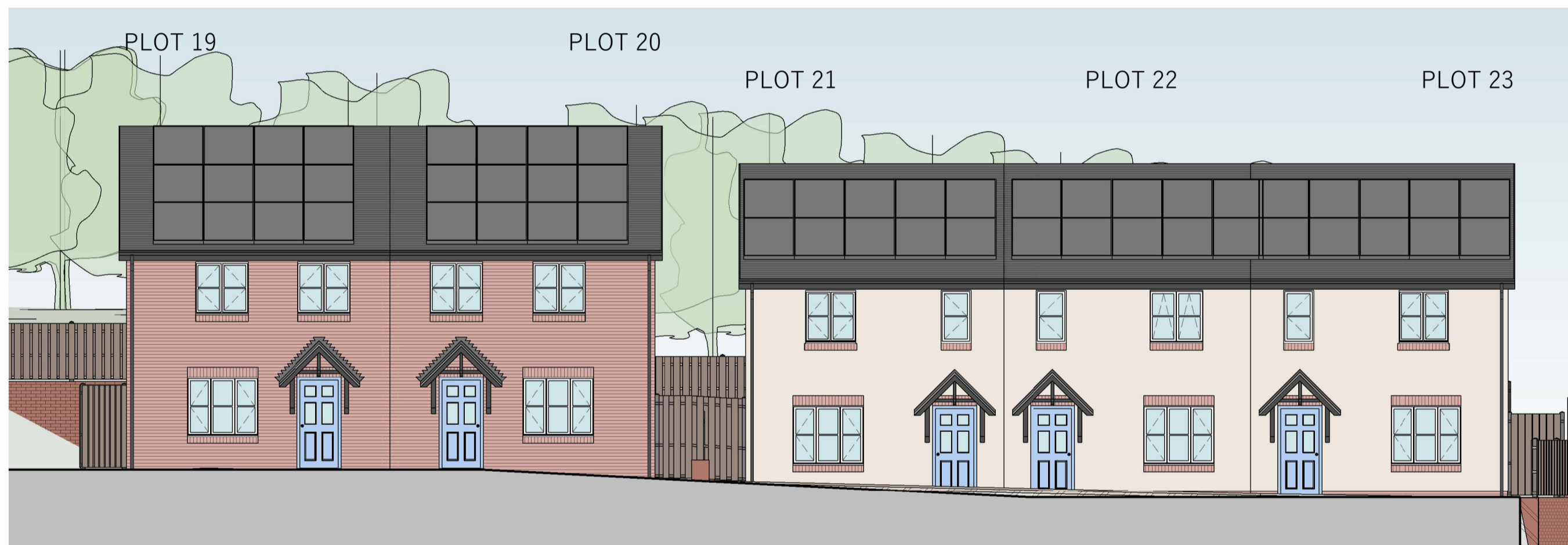
ROAD ELEVATION 2 SCALE: 1 : 100