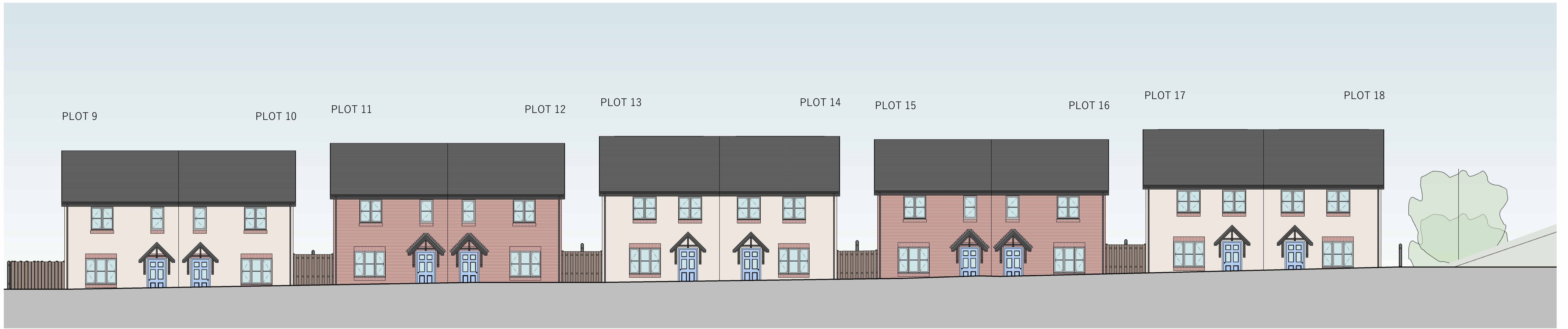
ROAD ELEVATION 1 SCALE: 1 : 100