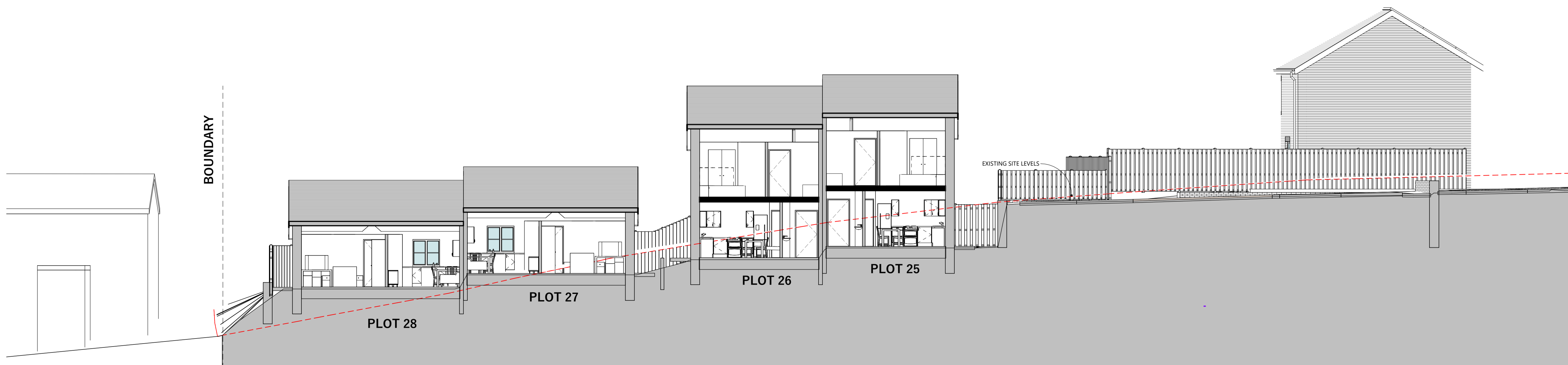
SECTION C-C SCALE: 1 : 100